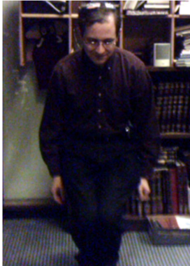
בְּרוּךְ (bend the knees)