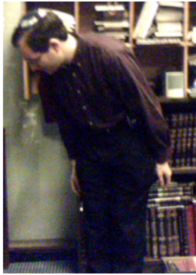
הוּא יַעֲשֶׂה שְׁלוֹם עָלֵינוּ (bow to right)