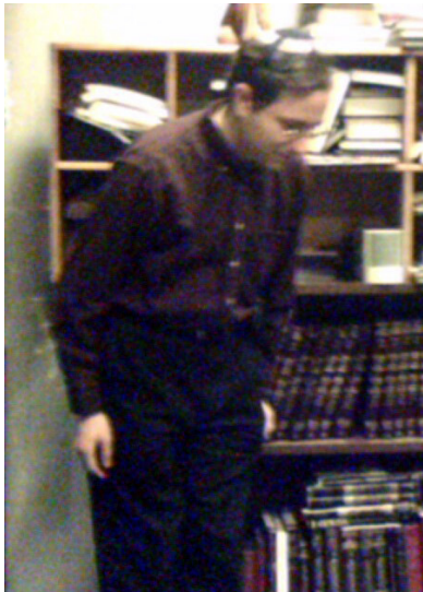
עוֹשֶׂה שְׁלוֹם בְּמִרוֹמָיו (bow to left)

It is customary for those reciting Kaddish to take three steps backwards (left foot first) before saying this last line “Who makes peace,” and to bow to the left while saying “עוֹשֶׂה שְׁלוֹם בְּמִרוֹמָיו,” to the right while saying “הוּא יַעֲשֶׂה שְׁלוֹם עָלֵינוּ,” and to the center while saying “וְעַל כָּל יִשְׂרָאֵל.” After saying Amen, take three steps forward (right foot first).