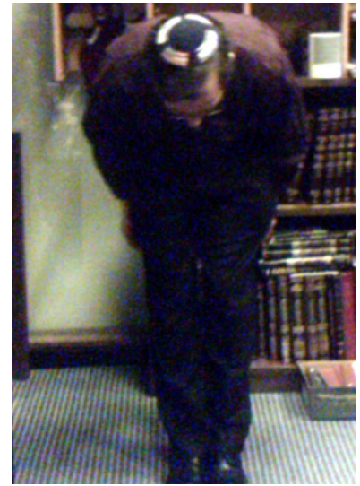
וְעַל כָּל יִשְׂרָאֵל (bow to center)